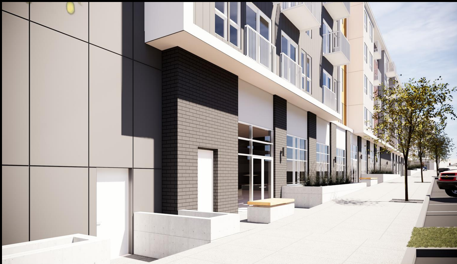
BUILDING F COMMERCIAL