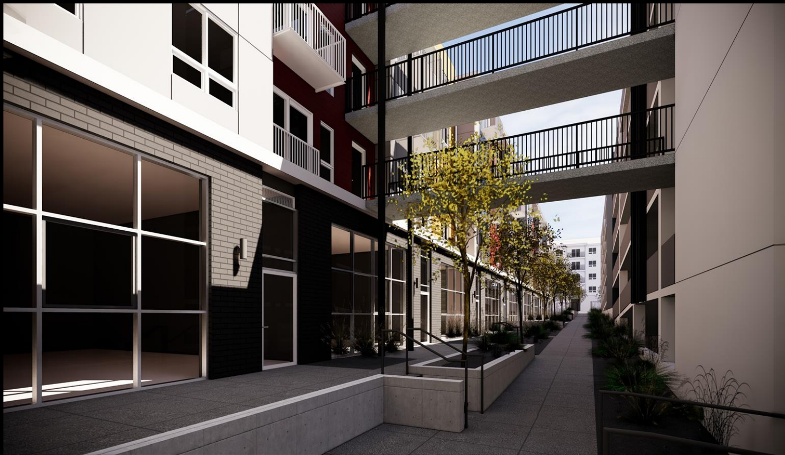
BUILDING F LIVE WORK ALLEY