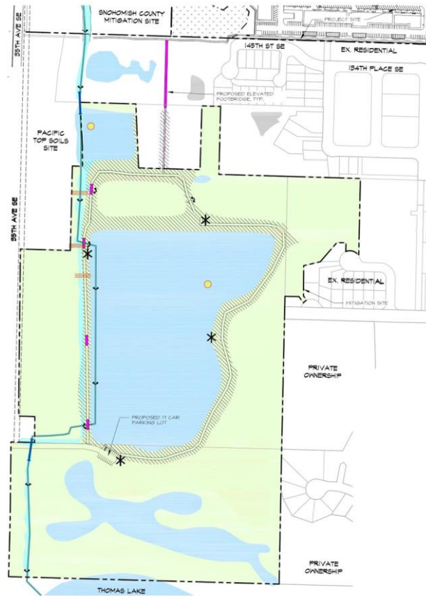
MITIGATION OVERVIEW PLAN - MITIGATION SITE