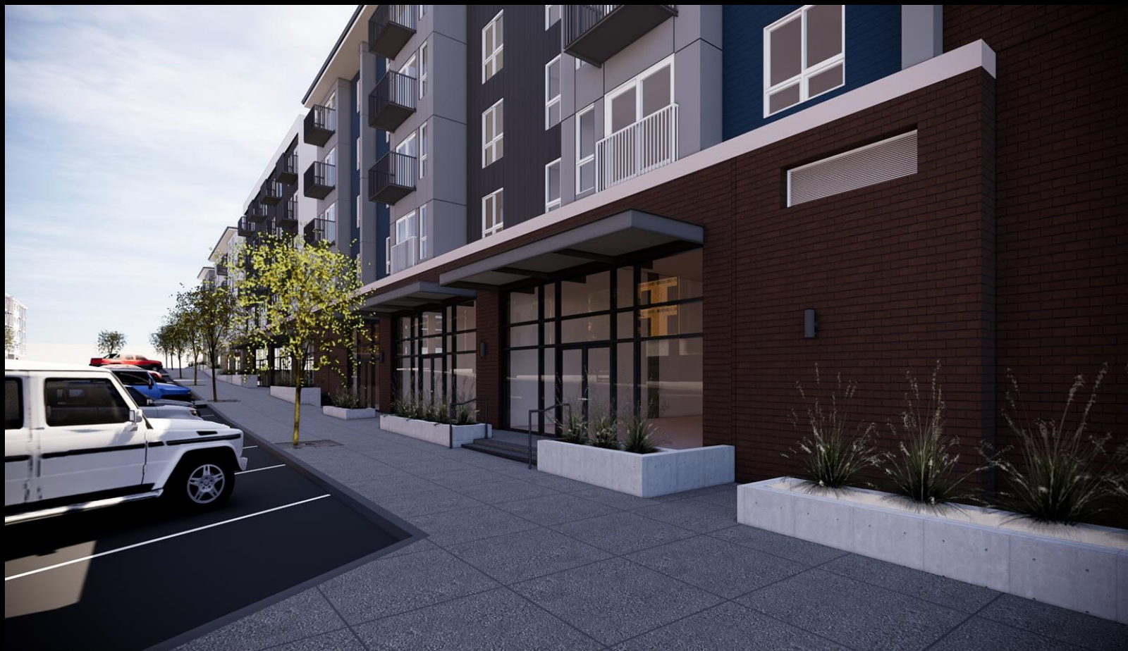
BUILDING E RETAIL